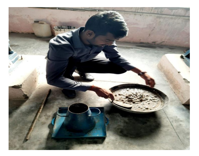
Fig -1: Sample Preparation