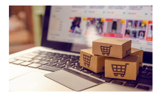
Fig 5 : E Commerce

In many ecommerce platforms like amazon, flipkart, snapdeal, myntra quizzes are available on demand basis. They can attend the quiz and if we are eligible for unlocking rewards offers based on their scores. This attracts the customers to purchase more items in that platform and avail discounts.