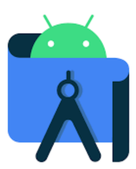
Fig 2: Android Logo