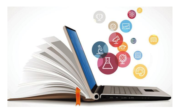
Fig 4: Digital Education

By taking a quiz, students can do critical thinking, and they can learn through innovation. These quizzes follow the learning process which helps students to understand their weaker areas of learning with instant feedback. Students can improve their learning by attending the quiz. After the submission of the quiz they can get the scores and can also check the correct answers. Re-attempting the quiz is also possible and students can achieve a good score.