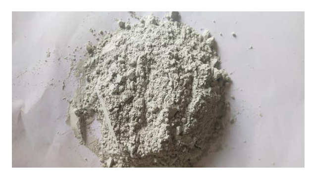
Fig: 1 GGBS

over a longer period in production conditions. This outcomes in a lower intensity of hydration and a lower temperature climb and make keeping away from cold joints more straight forward. but may also affect the construction schedule where a quick setting is required. ground granulated blast furnace slag is one of the mineral admixtures and it is obtained from the quenching of iron slag a by-product of iron and steel made from a shoot heater in water or steam, to deliver a shiny, granular item that is dried and ground into a fine powder properties is shown in Table 1