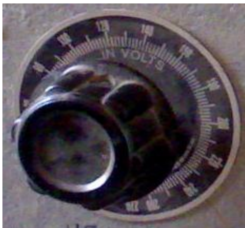
Fig - 3.5 Dimmerstat

2.4.4 Dimmerstat: A dimmerstat of range( 0- 1500 W) is named to fulfill the demand of varying heat input to assay the performance of heat transfer between water & colorful result as shown in fig3.5..