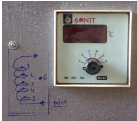
Fig - 3.4 Digital temperature indicator

are named. To record the temperature, a digital temperature index as shown in fig3.4., of least count 0.10 c and the range of 0- 5000 C is named.