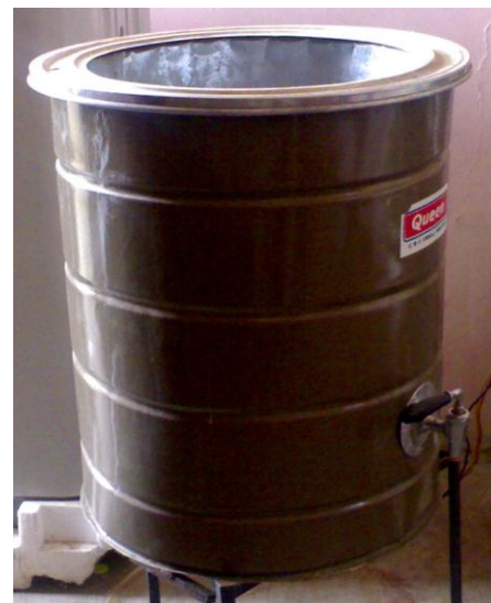
Fig - 3.3 Cylindrical tank

2.4.2 Cylindrical Tank: The criteria for selection of spherical tank should be similar that, the spiral coil arrangement, the heater and stirrer for agitation must accommodate in it. Considering the proper sizes, height of coil & the distance of spiral coil from the heater, a spherical tank of dimensions 30.5 cm inner periphery, height 41.0 cm with a consistence of 25 mm is named as shown in fig3.3. The tank named is of material GI & is the same used for water heater purpose in the home operation.