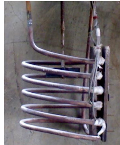
Fig - 3.2 Helical coil

2.4.1 Helical Coil: The material selection for the spiral coil is similar that, it must have high thermal conductivity. At the same time material should be easy to bend in the form of spiral structure, so the material named for the spiral coil which has both these parcels & it's fluently available. The dimension of spiral coil like inner dia. & length are named grounded on the vacuity of material and at the same time to accommodate the number of thermocouples along the length. To achieve proper heat transfer five turns of spiral coils of bobby material is named grounded on length of coil as shown iffing.3.2