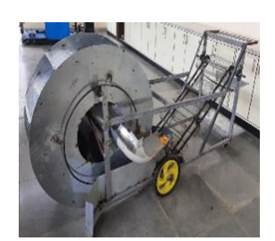
Fig. 1 Final assembly

The entire system for collecting and bagging areca nuts is housed in a mobile machine. The machine mainly involves two mechanisms, Rotary gear mechanism and chain conveyer mechanism. The rotary gear mechanism consists