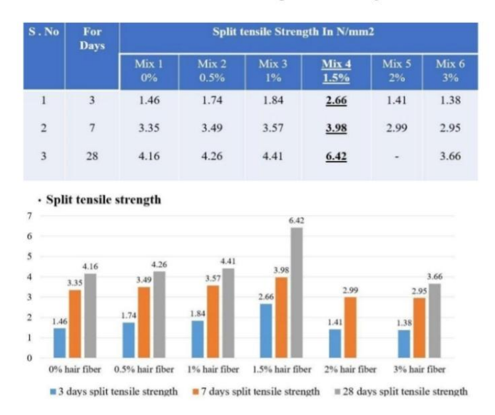
Table 5.7: Results of split tensile strength

Cylinder specimen 150X300mm was prepared using concrete with w/c ratio 0.5. The test was done after 3 days, 7 days and 28 days of curing and immediately after removing off from water. The surface water was wiped off. A diametric line on the two ends of the specimen was drawn so that they were in the same axial plane. One of the pressed wood strips was put along the focal point of the lower plate. The example was put on the pressed wood strip and adjusted to such an extent that the lines set apart on the closures of the example were vertical and focused over the compressed wood strips. The subsequent pressed wood strip was put longwise on the chamber. The load is applied without shock and gradually increased at a steady rate until the specimen failed by splitting at the vertical axial plane. Note the load.