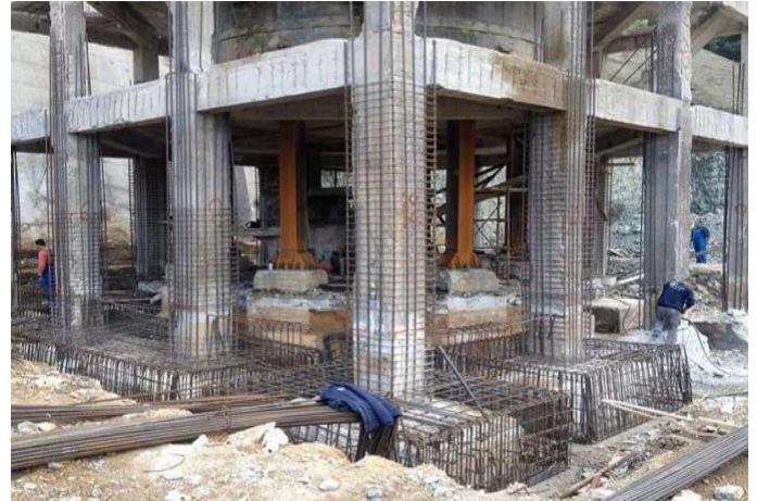
Fig -1: Retrofitting of the structure

Abstract – Risk management is now an important management technique in any project because of the possible negative impact of a risk on project objectives. The goal of risk management in retrofitting projects is to make informed judgments, avoid unexpected cost overruns, schedule overruns, poor quality, and incidents, and make the appropriate decisions to meet the retrofitting objectives. To prevent such risks in retrofitting projects, we must first identify them and then manage them. The goal of this study is to identify and understand the risks associated with retrofitting projects, as well as what steps may be taken to mitigate those risks. A good risk management strategy can assist in not just preventing but also resolving risk. The risks are described in this article, together with their influence on the project and the solutions (recommendations) that can be implemented to reduce or mitigate the risk.