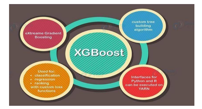
Fig 1. XG Boost Algorithm

The following are simple procedures that can be utilised to solve any data problem utilising the XGBoostAlgorithm: