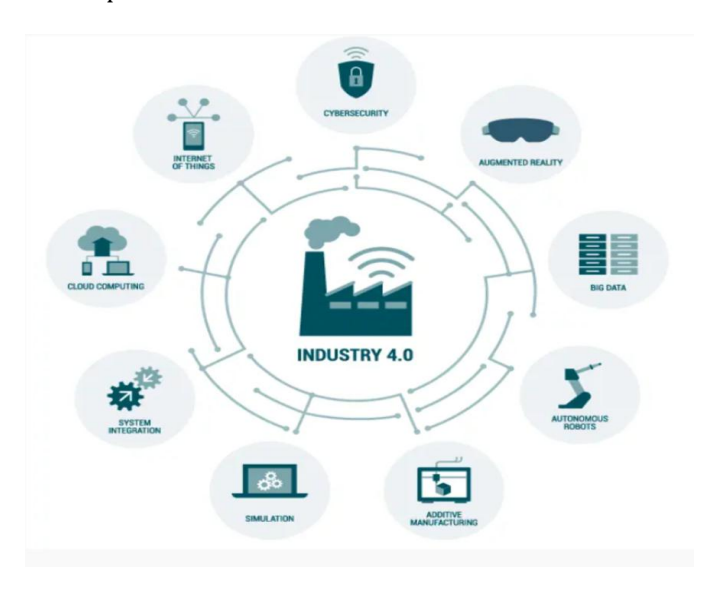
Fig- 1: Different aspects of Industry 4.0

In the health and pharmaceutical sector, in factories, they use technologies like AGVs for the development of internal supply, PC vision for the detection of defective ones. If we tend to mention drugs as a science, technologies like 3D bio printing became essential tools. 3D printing techniques mixed with cells and biomaterials combine to get tissues that have similar properties as living tissues. One among the goals is to print a totally practical human organ. Likewise, additive producing additionally permits the creation of 3D prostheses, customizing in every case the prosthetic device for the patient.