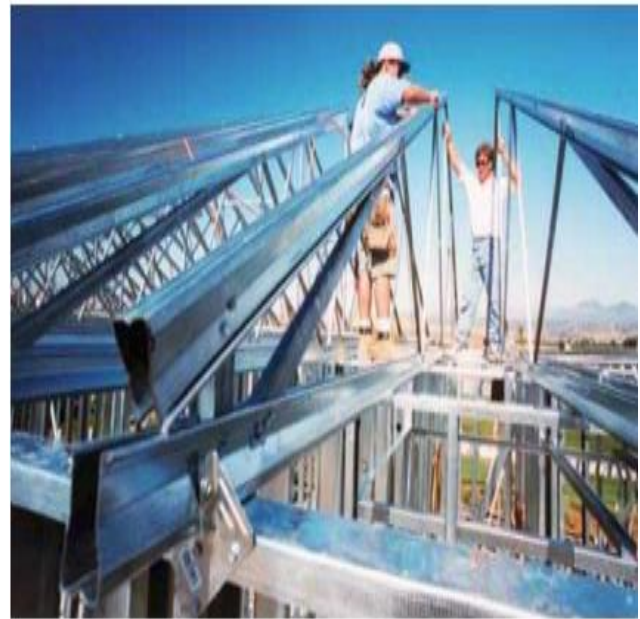
Fig -1: Cold formed steel

Due to lack of knowledge about the response of corrugated steel plate shear wall, elastic and inelastic behaviour, and design requirements of corrugated steel plate shear walls construction industry was stuck on the standard shear walls and later a new construction based on the steel plate shear wall is made that is corrugated steel plate shear wall. Corrugated steel plates have the same properties of flat steel plates, in addition to their superior in-plane stiffness and out-of-plane stiffness [2].