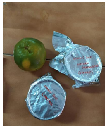
Fig -4: One of our food samples