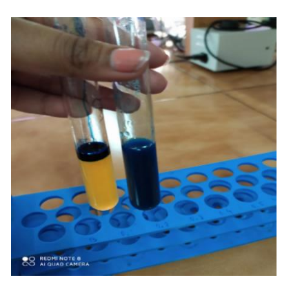
Fig -6: Lab Preparations