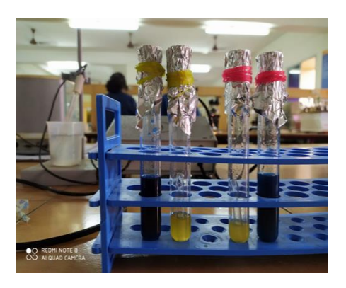
Fig -5: Some of the preparations for the experiment