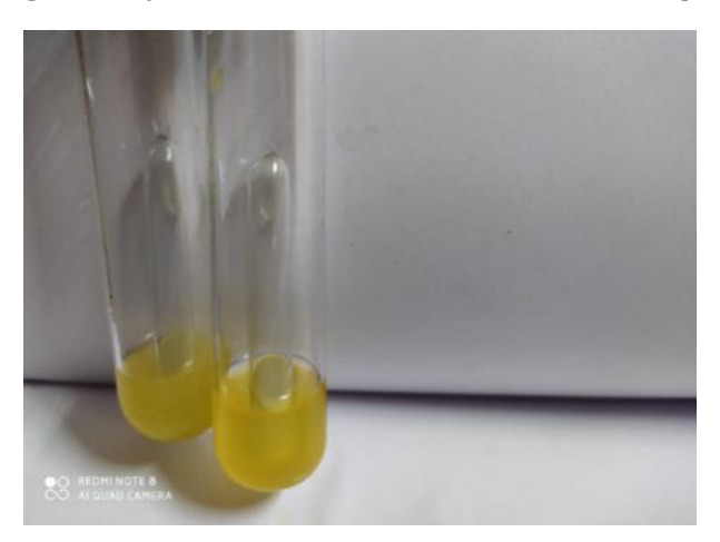
Fig-3: Durham's Tube Test of our food sample