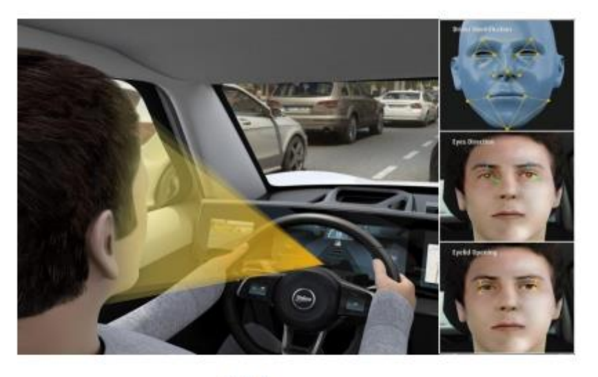
Fig 2 Fig 2 shows how the system would work and look in real world

Fig 1 shows the method used to develop the system to an efficient way. The algorithm used to process the image to feed the code to specify the face in the image, the image is divided into sub-regions to determine whether the region is on the face or not. The use of this algorithm means a time-saving method and only face-containing domains are processed.