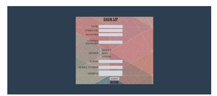
Figure 4 Sign Up and LOGIN