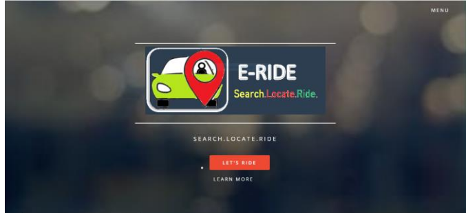
Figure 1 Home page of Website

E-Ride is an alternative which can come up with tremendous flexibility. The flexibility makes it a totally handy alternative for any lengthy commute. For the destiny invention of driverless motors or system drivers it is able to show handy due to its flexibility.