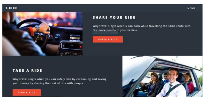
Figure 5 RIDER AND RIDE OWNER FORMS