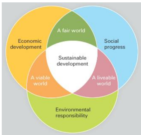
Fig -1: Sustainable development pie chart