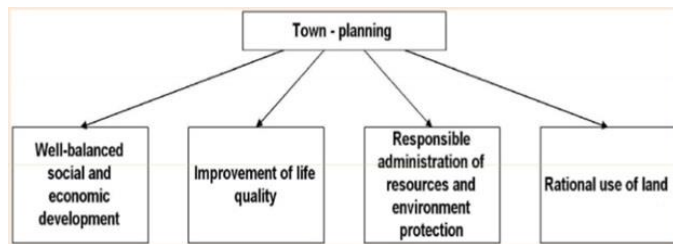
Fig -4: Role of town planning

To provide healthy conditions for both the rich and the poor to live, to work, and to play, enjoy and to relax, thus bringing about the social and economic and well-being for the majority of mankind.