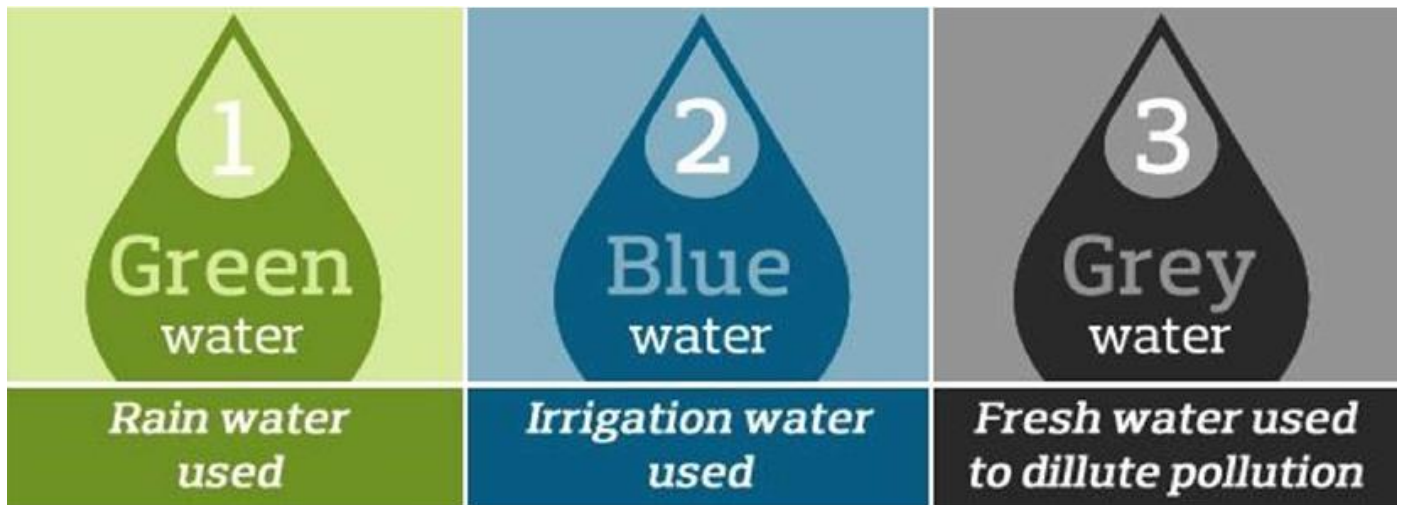
Fig- 1: Components of the Water Footprint (Arjen Y. Hoekstra et al.)