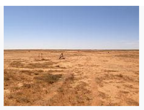
Fig: 3 Trial well field for in-situ recovery at Honeymoon, South Australia

Also known as solution mining, In-situ leaching (ISL), or in-situ recovery (ISR), involves leaving the ore where it is in the ground, and recovering the minerals from it by dissolving them and pumping the formed solution to the surface where the minerals can be recovered. Consequently, there is little surface disturbance and no tailings or waste rock generated. However, the orebody needs to be permeable to the liquids used, and located so that they do not contaminate ground water away from the orebody.