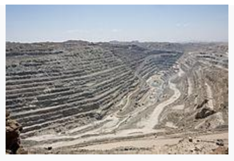
Fig: 2 Rössing open pit uranium mine, Namibia

In open pit mining, overburden is removed by drilling and blasting to expose the ore body, which is then mined by blasting and excavation using loaders and dump trucks. Workers spend much time in enclosed cabins in order to limit their exposure to radiation. Airborne dust levels is suppressed by an extensive used of water.