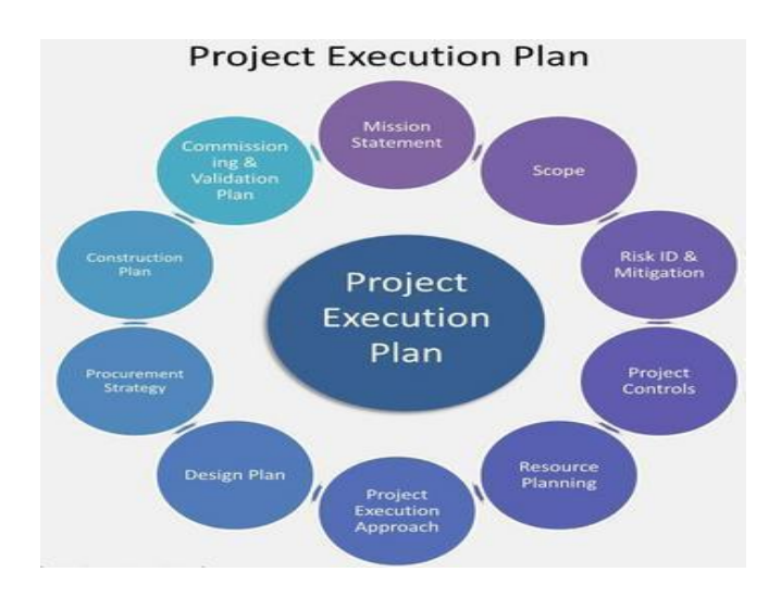
Fig: Project Execution plan

Volume: 08 Issue: 07 | July 2021 www.irjet.net p-ISSN: 2395-0072