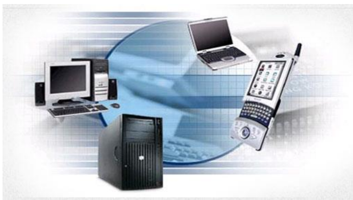
Fig -1: Name of the figure

IRJET sample template format ,Define abbreviations and acronyms the first time they are used in the text, even after they have been defined in the abstract. Abbreviations such as IEEE, SI, MKS, CGS, sc, dc, and rms do not have to be defined. Do not use abbreviations in the title or heads unless they are unavoidable.