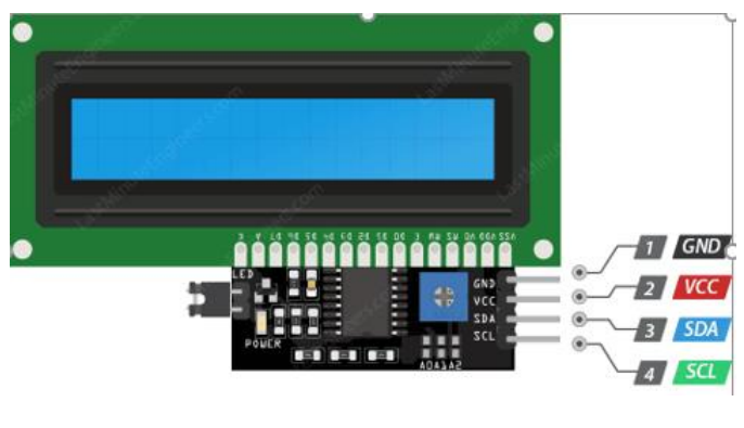
Figure -5: LCD

communication interface. It means it only needs 4 pins for the LCD display: VCC, GND, SDA, SCL. It will save atleast 4 digital/analog pins on the board. All connectors are standard XH2.54 (Breadboard type). You can connect with the jumper wire directly.