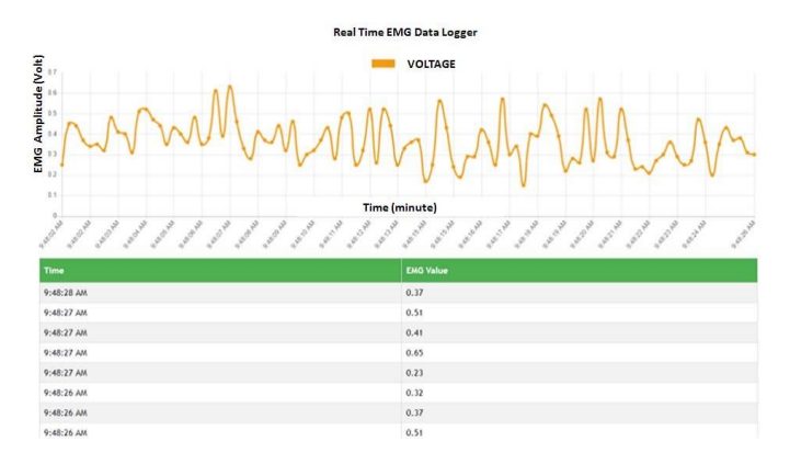
Figure -6: EMG monitoring system display interface

To think about the discoveries, Figure 7 portrays the EMG chart with accurate information procured from the checking framework's table, replotted on the graphical view.