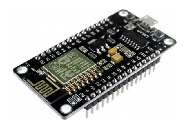
Figure -2: NodeMCU

your laptop and flash it without any trouble, just like Arduino. It is also immediately breadboard friendly.