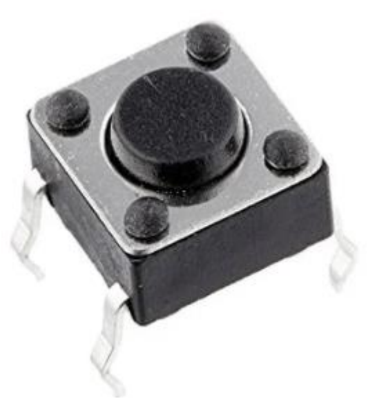
Figure -4: Button

LCB: This is 16x2 LCD display screen with I2C interface. It is able to display 16x2 characters on lines, white characters on blue background. Usually, LCD displays projects will run out of pin resources easily, especially with any board. And it is also very complicated with the wire soldering and connection. This IC2 16x2 LCD Screen is using an I2C