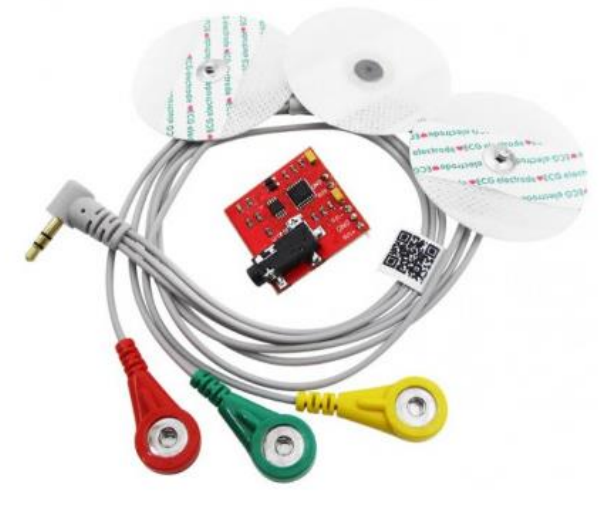
Figure -3: EMG

EMG Sensor: EMG Muscle Sensor Module V3.0 With Cable and Electrodes will measure the filtered and rectified electrical activity of a muscle; outputting 0-Vs Volts depending the amount of activity in the selected muscle, where Vs signifies the voltage of the power source. Power voltage: min. +-3.5V. By detecting the supply electromyogram (EMG), measuring muscle activity has traditionally been used in medical research, however with shrinking but more powerful microcontrollers and integrated circuits advent EMG power Road and sensors can be used for various control systems. This Muscle Sensor v3 measures, filters, rectifies, and amplifies the electrical activity of a muscle and produces an analogue output signal that can easily be read by a microcontroller, enabling novel, muscle-controlled interfaces for your projects.