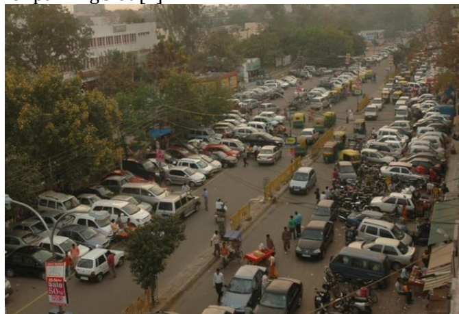
Fig -2: Existing Parking System

There is no live or automatic system available for parking. In cities with high vehicular congestion, finding an available parking spot can be a waste of time and resources. in areas such Delhi, automobiles looking for parking spots produced over 69.4 million tons of carbon dioxide. The inconvenience created by the need for finding a parking slot causes some drivers to park in unauthorized zones, plus increasing vehicular congestion and carbon dioxide emissions. For instance, if drivers had access to database containing information about parking spots in real-time, there would be more opportunities for selecting a proper route to a looked-for parking slot.[2]