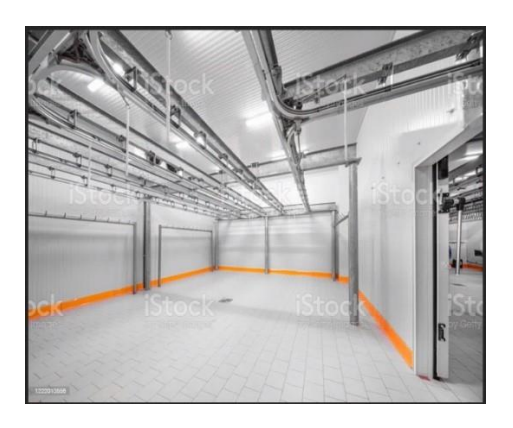
Fig 3 Cold Storage