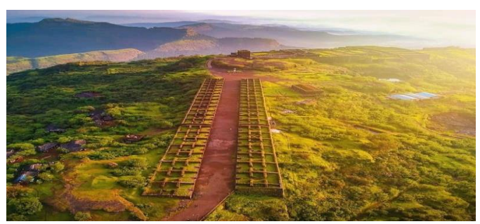
Figure 1 Raigad Fort

exceptional acoustic feature, where even a whisper by someone in the corner of the room was audible to the king sitting on the throne. Other remarkable spots in the fort are Hirkani Buruj, Jagdishwar temple, Bazaar Peth, Samadhi of Shivaji Maharaj, and Jijabai, Gangasagar Talao, etc. Raigad was a perfect example of fort architecture until 1818 when it was looted and destroyed by the British. From Magnificent doors to royal hallways to impregnable security this engineering marvel has got it all. Fort's simple yet advanced construction that has proven its worth centuries before and vet still amazes us till date and has therefore become the choice of our research.