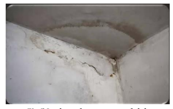
Fig 5 Leakage from corner of slab