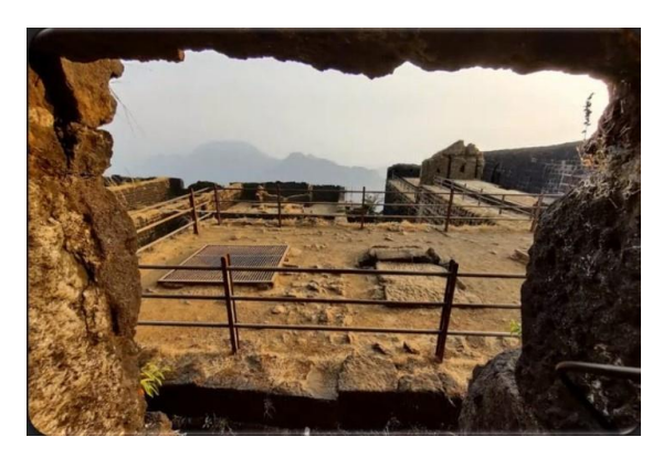
Fig 4 Food Storage in Ancient times