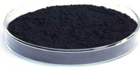
Fig. Graphene powder