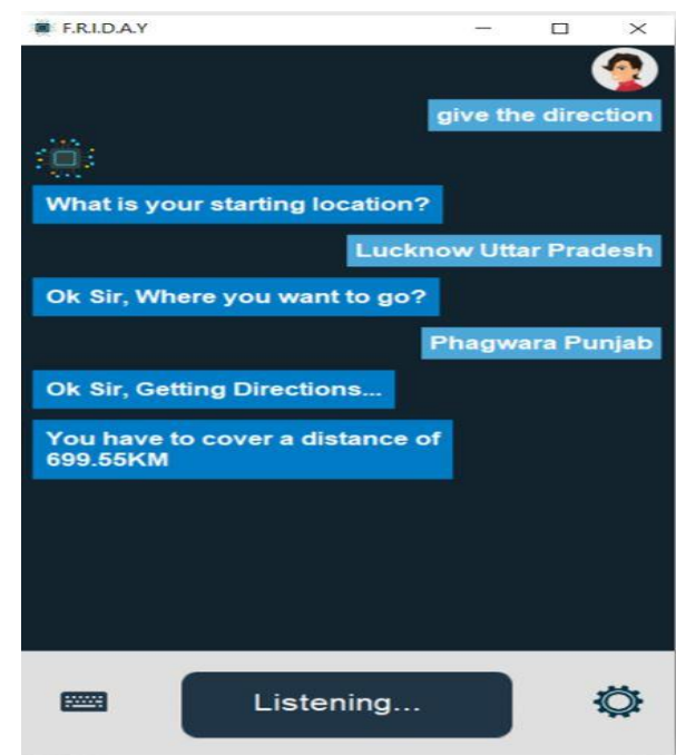
Fig 4: Distance estimated by F.R.I.D.A.Y using Google Maps

© 2021, IRJET | Impact Factor value: 7.529 | ISO 9001:2008 Certified Journal | Page 3429