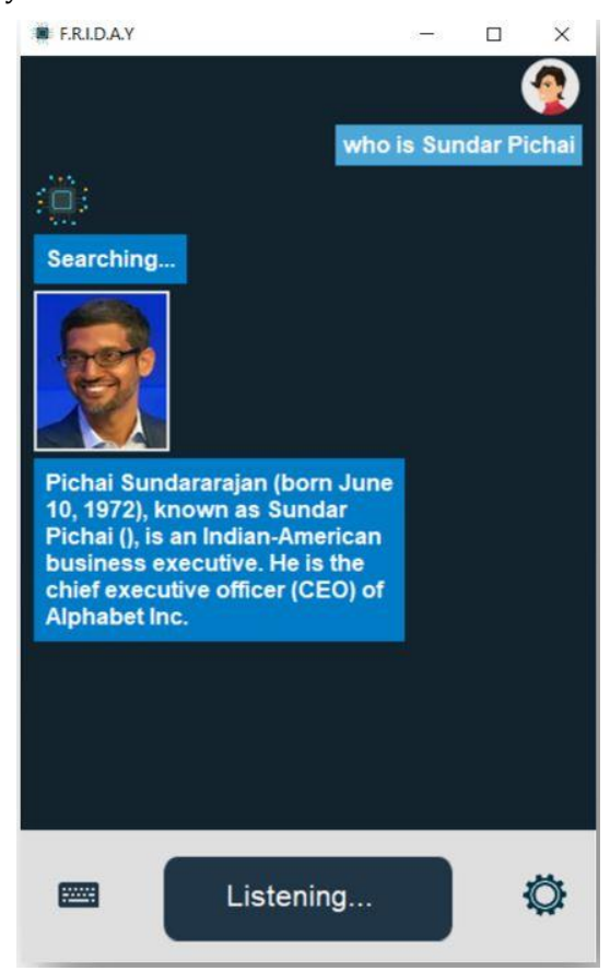
Fig 3: Web search result for Sundar Pichai by F.R.I.D.A.Y

5. Finally, the result is again converted back to the speech format from the text format using pyttsx3 module present in the Python and is returned back to the user.