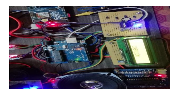
Figure 7.3 Hands on kit after accident.