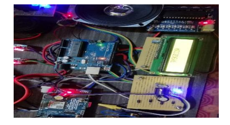
Figure 7.2 Hands on kit after door voice is on