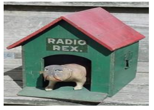
Fig-1: Radio Rex from the 1920s - The first speech recognition machine

The very first voice-activated product was released in 1922 as Radio Rex. This toy was quite simple, wherein a toy dog would stay inside a doghouse until the user exclaimed its name, "Rex" at which point it would jump out of the house. This was all done by an electromagnet tuned to the frequency similar to the vowel found in the word Rex, and predated modern computers by over 20 years.