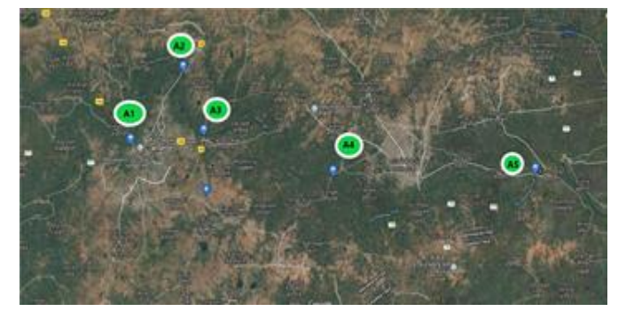
Fig -1: Geographical distribution of the sampling stations from river Panchaganga.