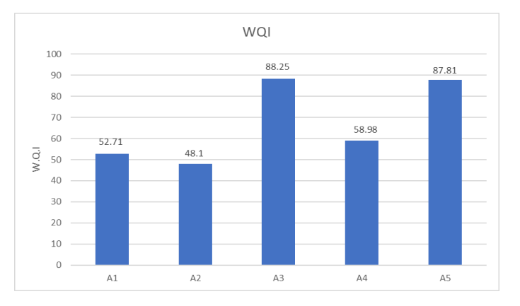
Chart:-1 Graphical Water quality index (WQI) for the river water sampling stations