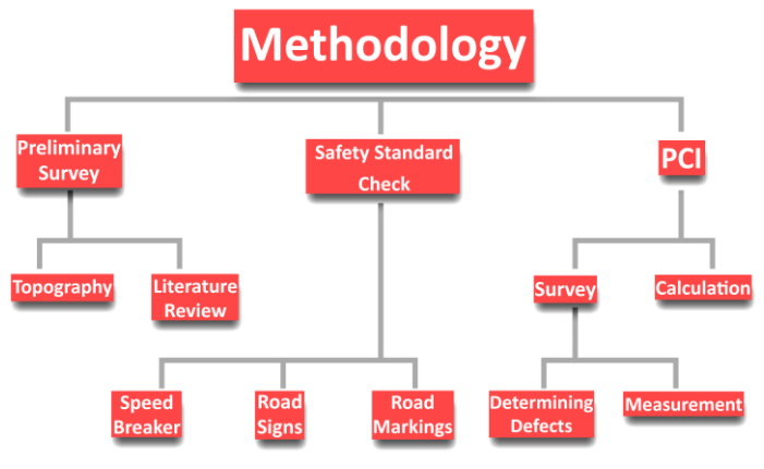
Fig. 2: Pavement Condition Index