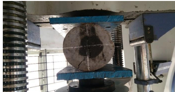
Fig -1: Split Tensile Test of Concrete

Compression testing machine, two packing strips of plywood 30cm long and 12mm wide.