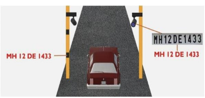
Fig -3: Proposed System Architecture