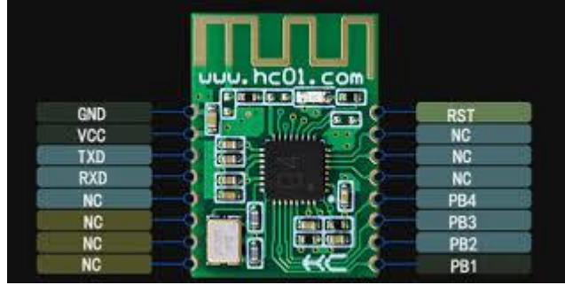
Fig 2: HC-04 Bluetooth Module

HC – 04 Bluetooth Module: The Bluetooth technology manages the communication channel of the wireless part. The Bluetooth module can receive and transmits the data from a host system with the help of the host controller interface (HCI). It provides a range of up to 10m at a transmit power of 1 m watt. The range can be extended to 100m if the transmit power is increased to 100 m watt. A Bluetooth module is a short range device of around 10 meters which provides both sound and data transmission.