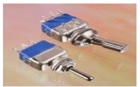
Fig4.4 Toggle Switch

Volume: 08 Issue: 03 | Mar 2021 www.irjet.net p-ISSN: 2395-0072