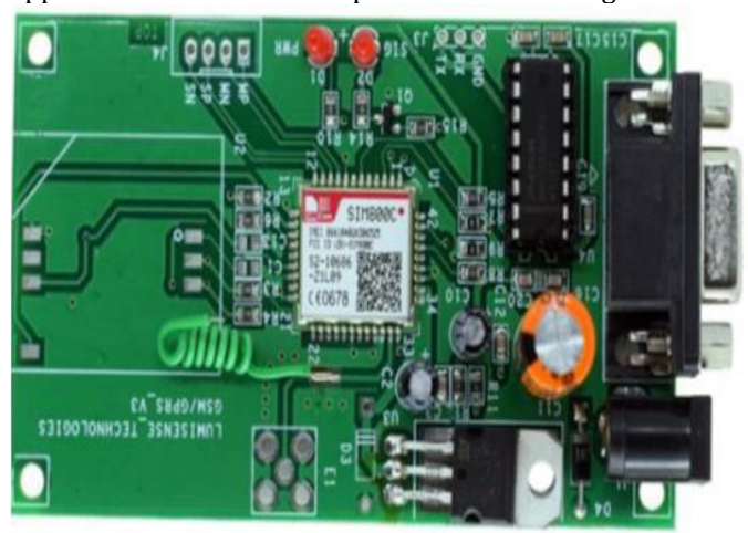
Fig4.2 GSM Modem

GSM (Global System for Mobile communications) is an open, digital cellular technology used for transmitting mobile voice and data services. SIM800 GSM modem accepts any GSM network and can act as SIM card. It also like a mobile phone works with its own unique phone number. It has a GSM/GPRS 900/1800MHZ performance for voice, Data, Fax and SMS in a small form factor and with low power consumption. The space requirement for this model is also less as its configuration is 24mm x 24mm x 3mm which makes it applicable for slim and compact demand of design.