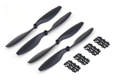
Fig - 4: Propeller

Propeller- As per the frame size and motor rating, the size of propeller is selected. Thus we are selecting the propellers of size 11" and weight 25 gms each.