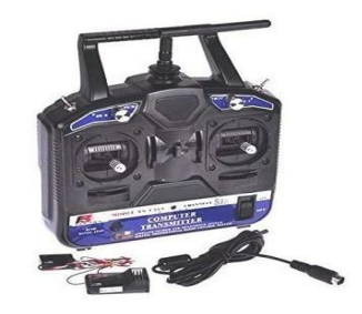
Fig – 6: Radio Controller

Radio Controller- Firstly, The transmitter should be calibrated with the flight controller using the receiver. After calibration transmitter will link with the drone, as per the transmitter the drone will work.