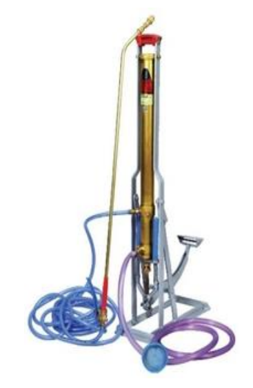
Fig 1. - Foot operated spray

Foot operated sprayer is operated with pedal lever by the foot of the operator and need at least two persons. Insecticide liquid to be used is kept in container sucked by a suction hose. Ball valve present in piston assembly worked as suction valve. Liquid to hydraulic nozzle is delivered from pressure chamber via pump cylinder.