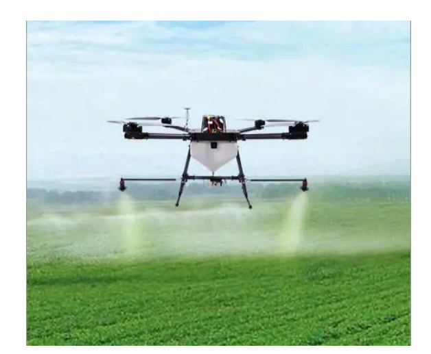
Fig5.-Aerial vehicle based spraying

Aerial vehicle based spraying is widely used in small and medium farms where low volume spraying of