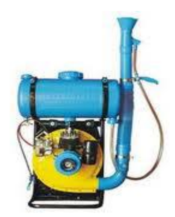
Fig3.- Motorized knapsack sprayer

Knapsack sprayer is lever operated and applicator of insecticides carries it on back with help of straps. Lever us used to actuate the sprayer by moving lever updown. Knapsack sprayer consist tank, pump, pressure chamber, nozzle, delivery hose and operating lever. Generally continuous 15 to 20 strokes per minutes are required use knapsack sprayer which results in pressure of 40 psi. For low volume spraying motorized knapsack sprayers/mist blowers are used and can be converted into power dusters easily.