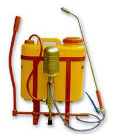
Fig2. - Knapsack Sprayer

Knapsack sprayer is lever operated and applicator of insecticides carries it on back with help of straps. Lever us used to actuate the sprayer by moving lever updown. Knapsack sprayer consist tank, pump, pressure chamber, nozzle, delivery hose and operating lever. Generally continuous 15 to 20 strokes per minutes are required use knapsack sprayer which results in pressure of 40 psi. For low volume spraying motorized knapsack sprayers/mist blowers are used and can be converted into power dusters easily.