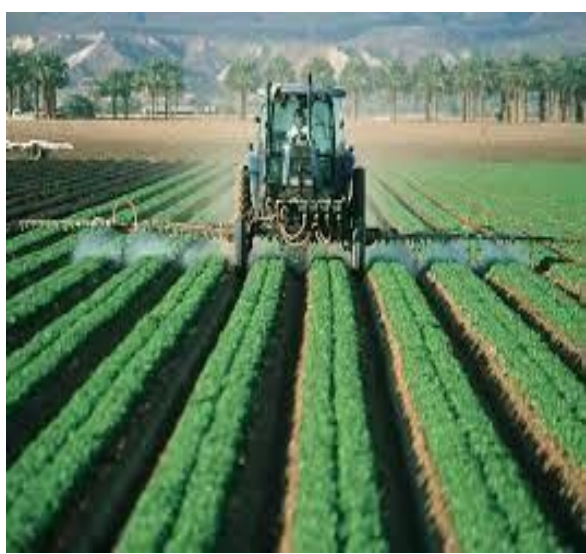
Fig4.- Tractor mounted spraying system

Tractor based spraying is used for spraying almost all types of insecticides, fertilizers and herbicides which helps to protect the farming products from insects, weed killers etc. The system consists of container to hold spraying liquid, nozzle and pipe. Tractor mounted spraying system is suitable for small to medium farms and is widely used in India.