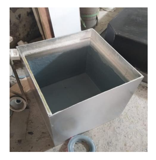
Fig -1: A glass fiber model of 2 feet*2 feet*2

Model of 2 feet*2 feet*2 feet was prepared. Model was made to show the applicability of subsurface drainage. The model was made of glass fiber. 7 holes for passing the perforated pipes were made. The test on model was on trialand-error method.