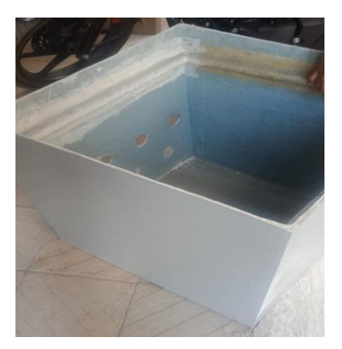
Fig -3: Holes drilled for passing of pipes through the model face