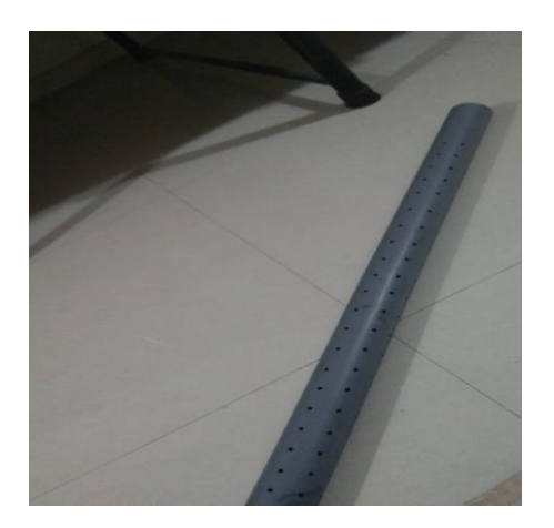
Fig -4: Perforated PVC pipe

Perforated PVC pipes have underground life of 50 years. Use of PVC pipes lowers the cost of transportation and. PVC drainage pipe is adhered to the expansion and contractions due to temperature change. Therefore, the bonding process should be preferred where temperature is not of much difference.