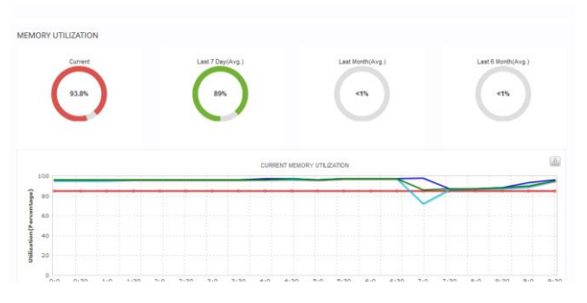
Figure 3. memory utilization test figure

of the Memory utilization at every acquiring moment and its changing rate.