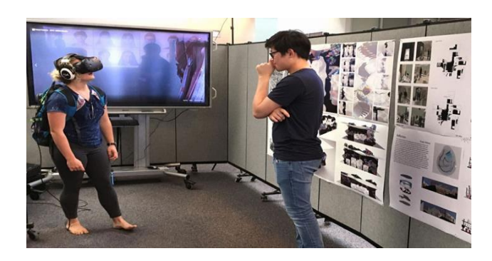
Fig -3: Students experience immersive virtual spaces at the College of Architecture at Texas A&M University.

These are only a couple of the numerous tools accessible to investigate AR and VR and begin rapidly at various levels and content areas.