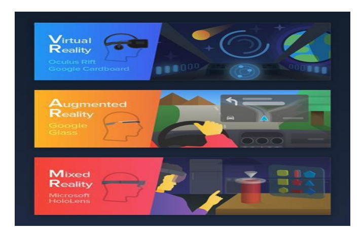
Fig -1: Difference between VR, AR, MR The capacity to reflect genuine circumstances gives