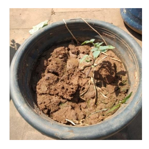
Fig 5. Result of Day 10

The obtained compost samples are tested with tomato plant and their growth is monitored. The results are as follow: