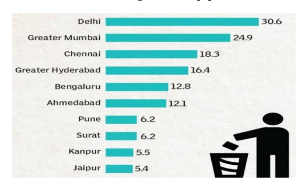
Fig 1. Annual waste generation in Indian cities