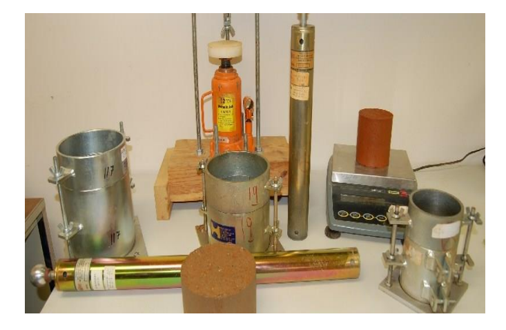
Fig-2: Compaction Test

Compaction is one kind of densification that is realized by rearrangement of soil particles without outflow of water. It is realized by the application of mechanical energy. It does not involve fluid flow, but with moisture changing altering. For the compaction test of the soil, using the Standard Proctor test. The figure of the SPT is given below: