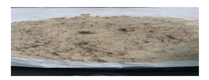
Fig.1 Mixing of Sawdust with Jaggery Mixer