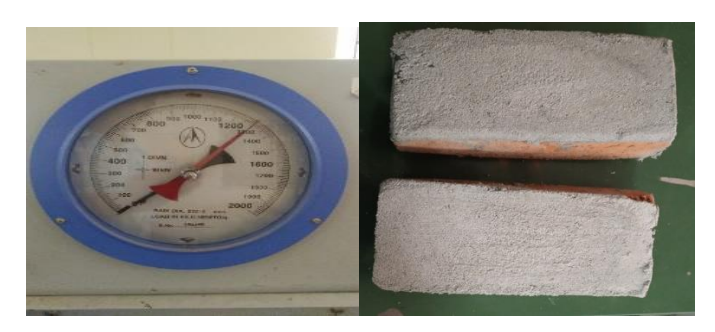
Fig .4 Compressive Strength Testing

The above table shows the Compressive load applied on test specimen in kilo Newton (kN) which will the primary factor to calculate the compression strength of bricks.