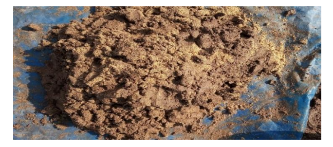
Fig.2 Mixing of Clay Sawdust with Jaggery Mixer