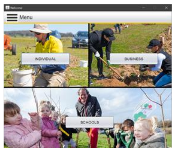
Fig. -2: Categories