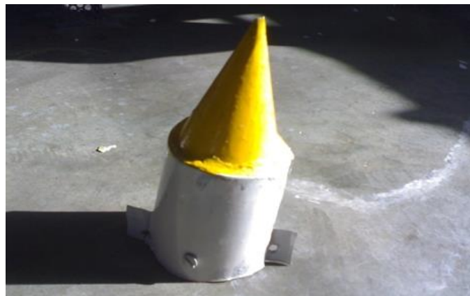
Fig. 2- Nosecone