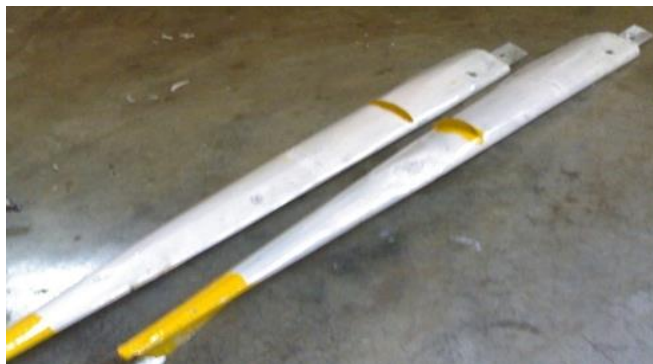
Fig.1- Turbine Blade

Study of power output in the terms of rotational kinetic energy. speed in rpm i.e. rotation per minute. Turbine model is carried out on the model as varying rpm.