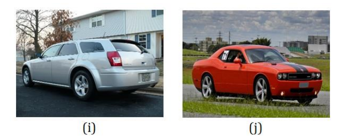
Fig -1 : Different Car body type examples (a) Cab, (b)Convertible, (c) Coupe, (d) Hatchback, (e) Minivan, (f)Sedan, (g) SUV, (h) Van, (i) Wagon, (j) other