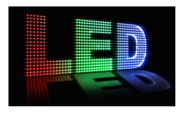
Figure 3: LED Display

Light Emitting Diode, in short LED is a semiconductor device based on the Electric Luminescence principle. It has no moving parts, only made for solid materials. So often designed into transparent body. It is commercially used device for screening the display board. When LED is supplied from its two semiconductor coated terminals then it starts emitting light without heating that reduces the problem of heating in electronic components. LED based display consist of a number of LEDs connected closely to each other. By changing the value of each LED's brightness, a image is form that is the our required output displayed on display board. The image form has brilliance light intensity. This type of display is more efficient and less power consuming. For designing a LED display board following factors should be already known such as the display type, color, size, brightness, and the number of LED required for that particular display board.