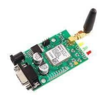
Figure 1: GSM Modem.

GSM is nothing but a Global System for Mobile Communications chip that works as a medium between mobile phone (transmitter) and display board (receiver). It was flourished by the European Telecommunications Standards Institute (ETSI). It is the main part of the whole setup. The GSM modem is linked with power supply circuitry and communication interface (RS-232) with programmable devices. It can also be linked with dedicated modem devices like input-output serial ports, USB (Universal Serial Bus), Bluetooth or mobile phone that make it more compatible to use. Each GSM module is linked with an identical mobile phone. It is also implemented for voice and data services operate at the 850MHz, 900MHz, 1800MHz, and 1900MHz frequency bands. In case of interference between two information, GSM modem uses time division multiple access (TDMA) technique that gives it different time slot for each user at same frequency to send their information. GSM modem has very wide applications in many fields such as in transaction terminals, supply chain management, security applications, weather stations, and GPRS mode remote data logging.