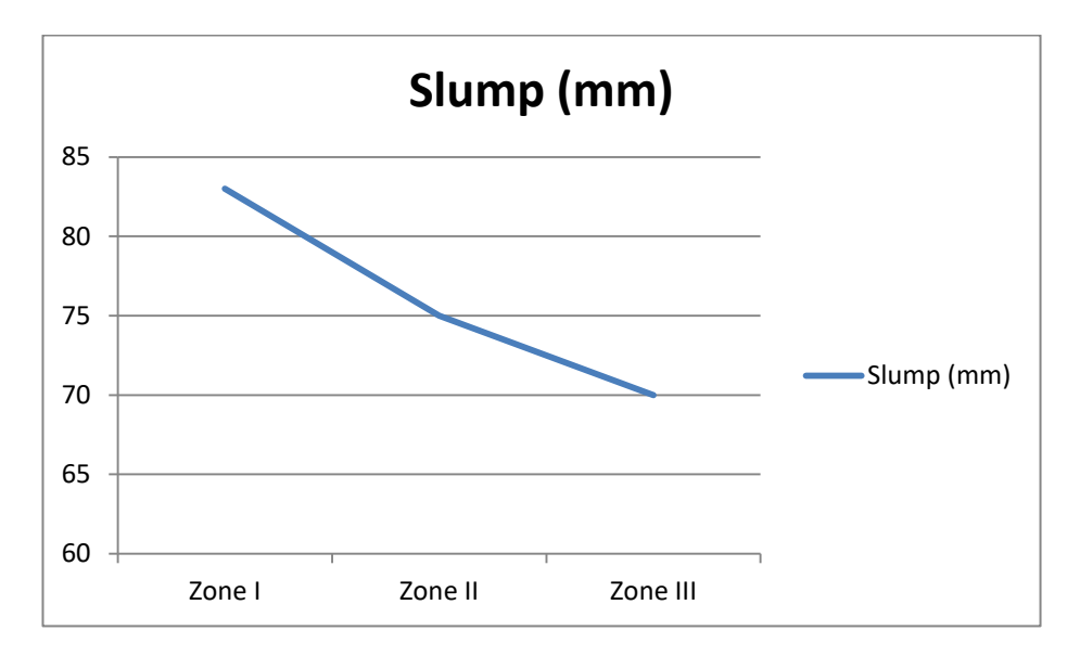
Graphical representation for M30 grade of concrete