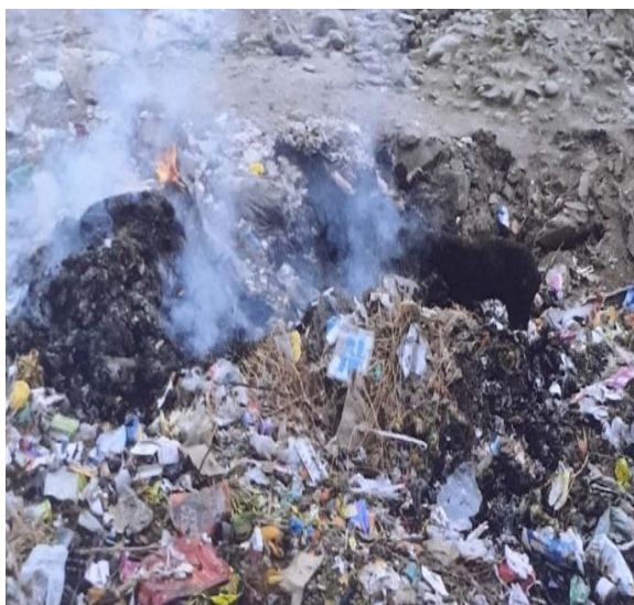
Waste Being Openly Burnt at Daderhama

Ganderbal Town of Ganderbal district of J&K is disposing off the MSW at Nearby Open dumpsite on Main Road obtaining lot of Resistance from the local People and also dumping the waste in Wetlands near in the vicinity of Nallah Sindh, which has attracted lot of resistance from people.