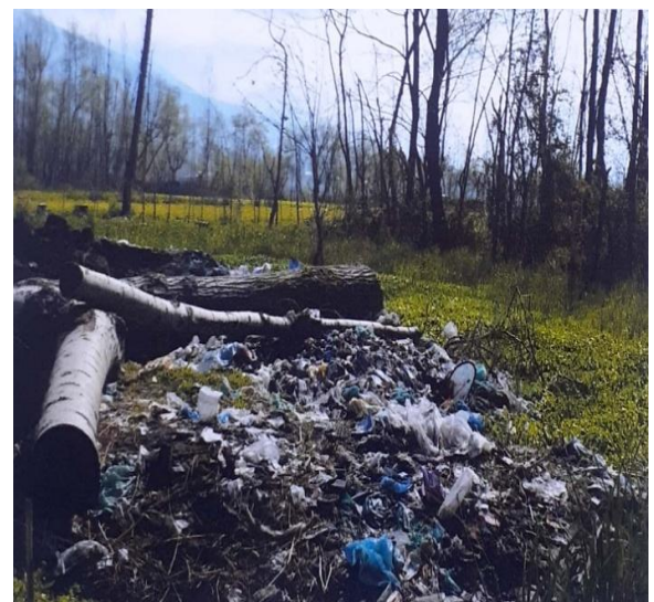
Waste Dumped Near Paddy Fields