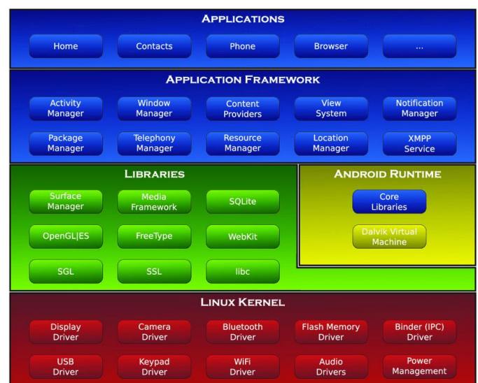
Fig -2: Architecture of Android OS

Above figure shows that Android operating system contain a stack of software components layers. The main layer of Android components is-