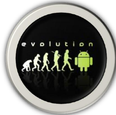
Fig-1: An evolution of Android Operating system

The Figure 1 shows that the evolution of Android Operating system.