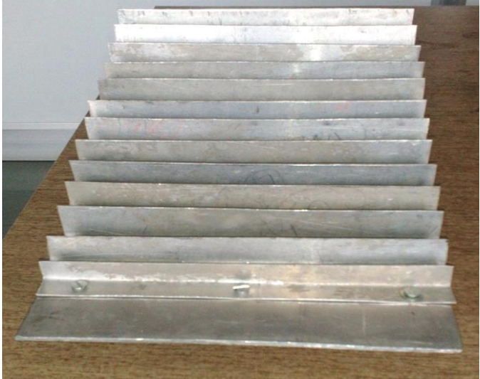
Figure-1: Pictorial View of a Fin Array Sample

During the experiments, the heater was connected with a power supply through a variable transformer to control the power input. The variable transformer was used to control the power input and hence the input heat flux and corresponding Rayleigh number were controlled. A digital multimeter with accuracy of \pm 0.4\% for voltage as well as the resistance was used to record the output data. The surface temperature distribution of the base plate of the fin array was measured using six K- type Teflon coated chromelalumel thermocouples are equally spaced and distributed as shown in figure. In order to facilitate the thermocouples installation within the enclosure without disturbing the heat transfer