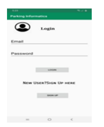
Figure 3.3: Authenticating client details into server

Once the user registers, he can use his email id and phone number to login in the future. This authenticates the user.