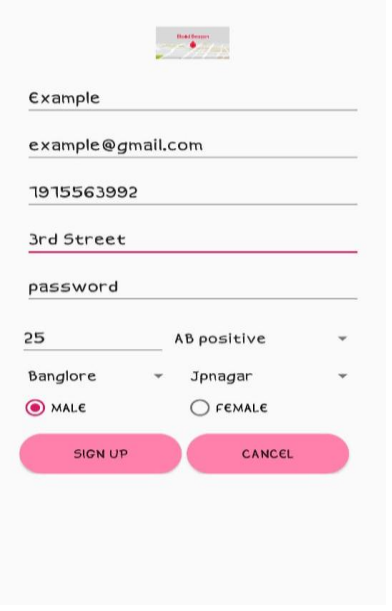
Fig -3: Sign up page