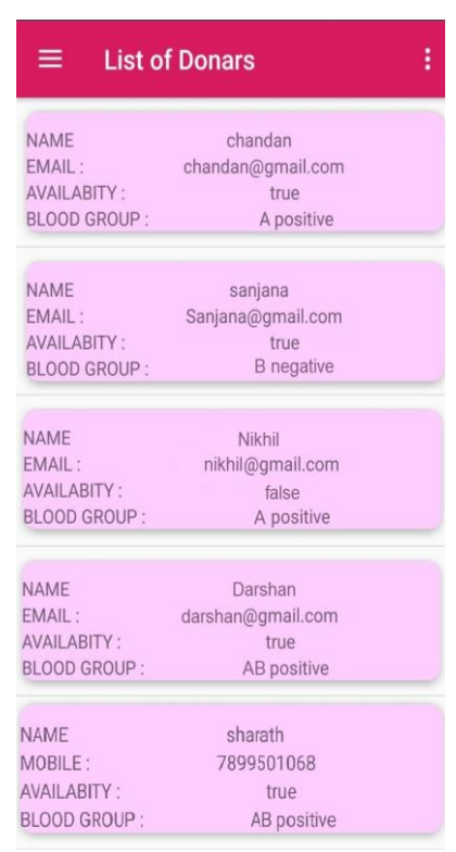
Fig -4: Donors List