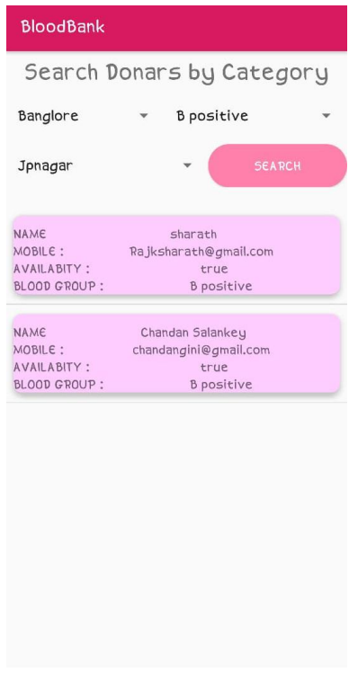
Fig -5: Search page