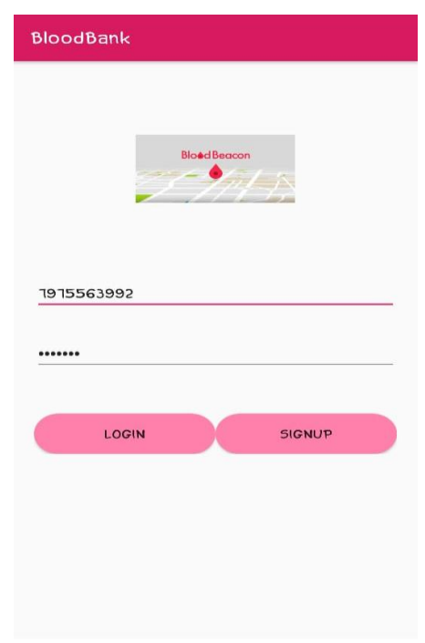
Fig -2: Login page