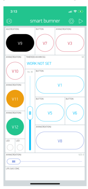
FIG-1: APP DETAILS

Here in the app I had designed some button, led, switch and notification enable to give the user to interact with the gasburner and get information through it.